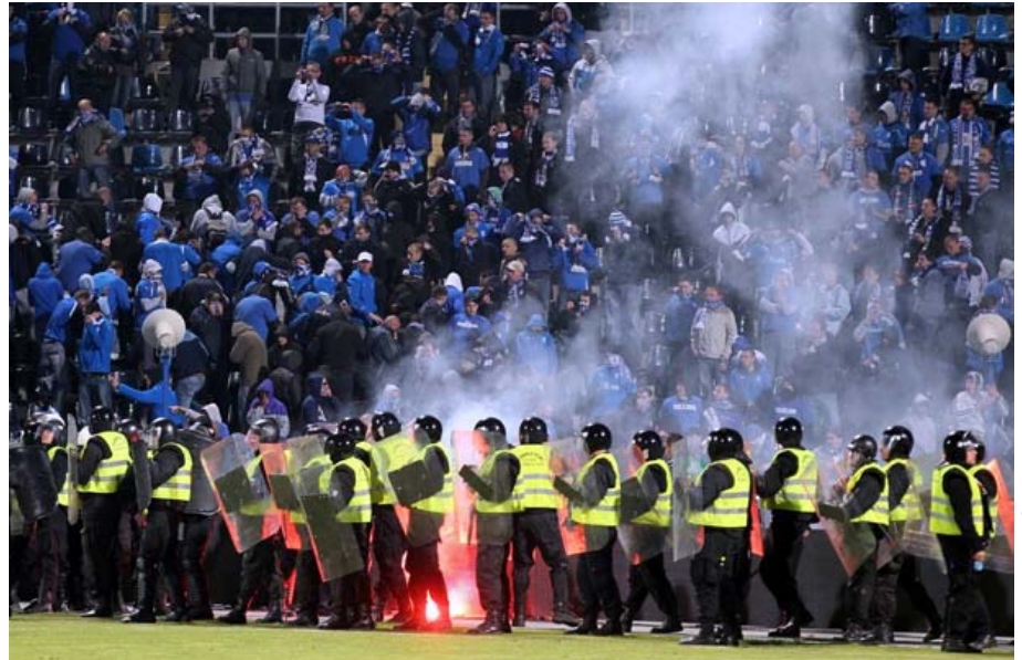
Scenes witnessed after the Cup Final demonstrate stories of hooliganism being under control are a myth

As a punishment, both clubs will now play their next games behind closed doors.